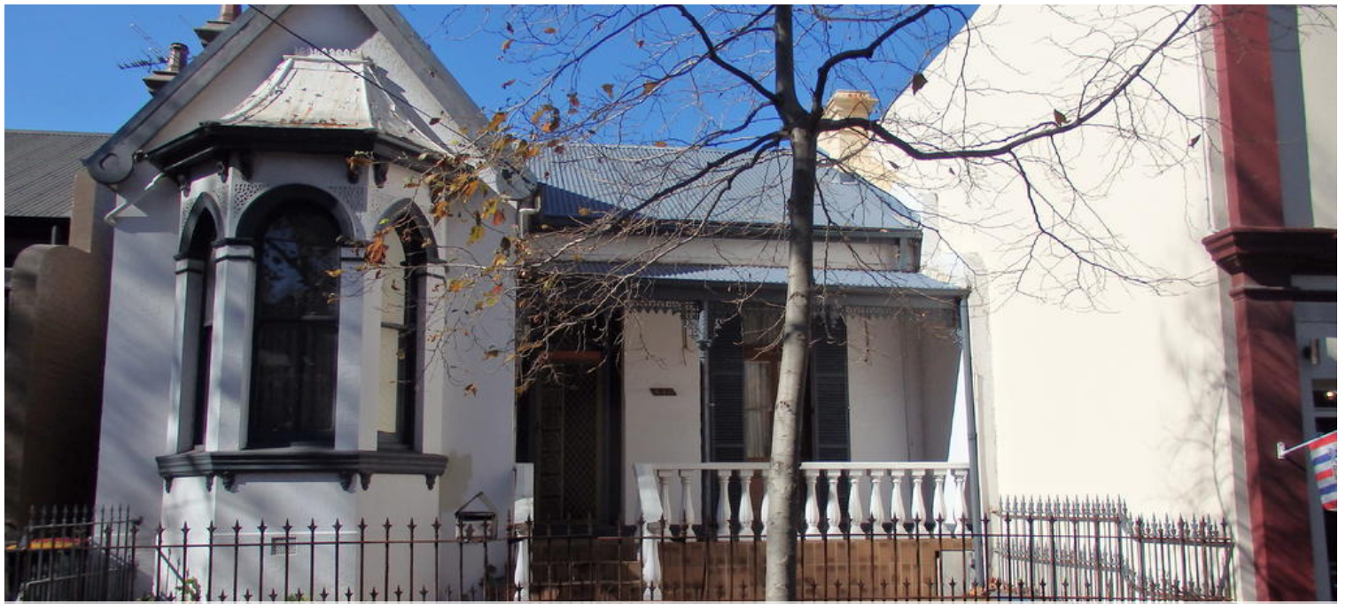
640 Bourke St, Surry Hills