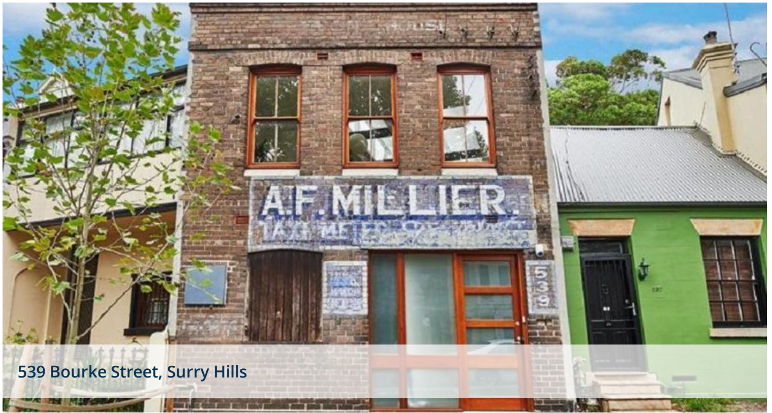
539 Bourke Street, Surry Hills