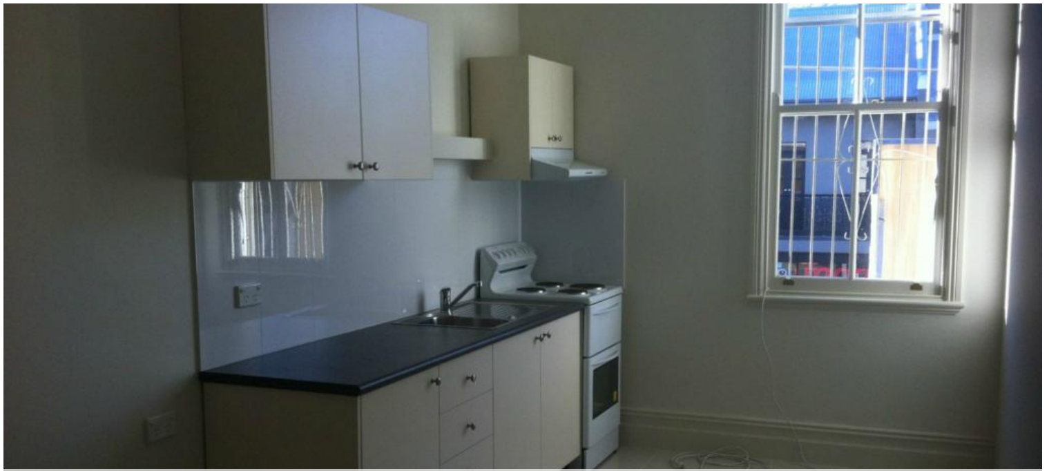
Unit 1, 427 Cleveland Street, Surry Hills