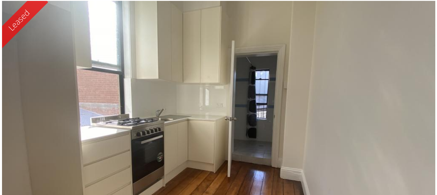
Unit 1, 452 Cleveland St, Surry Hills