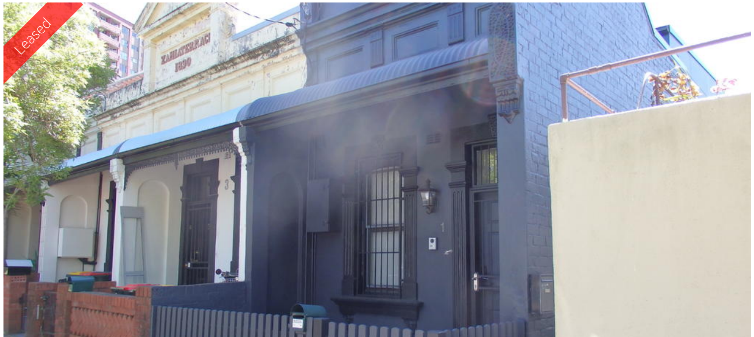
1 Zamia Street, Redfern