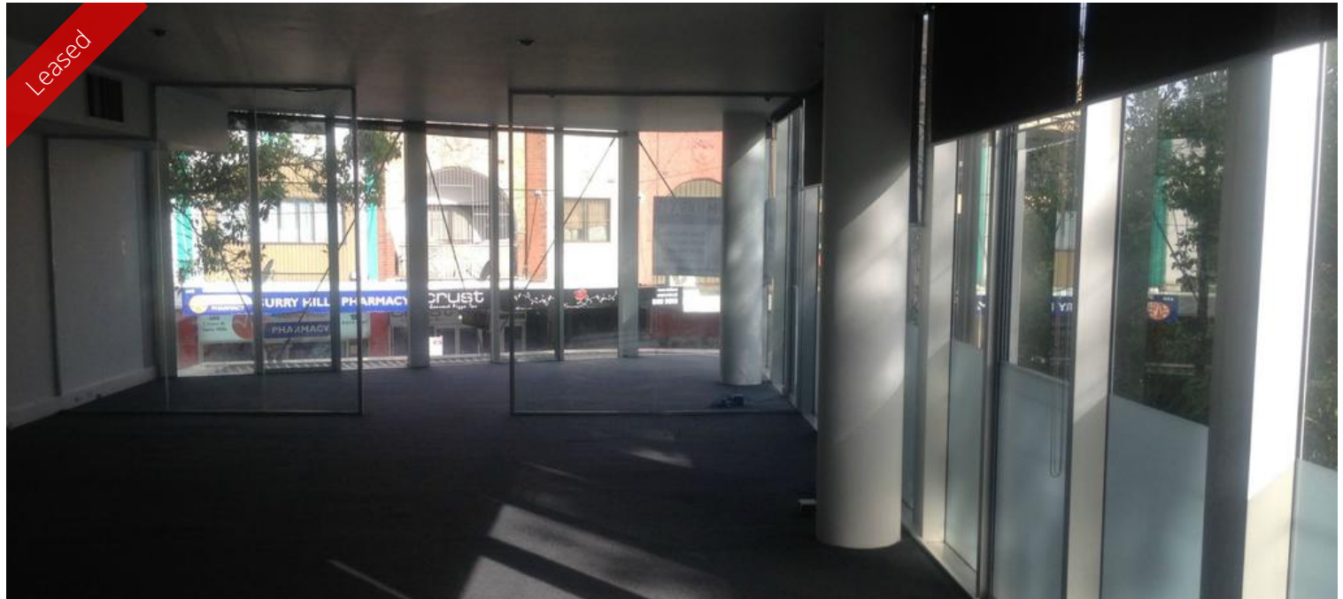
Suite 3, 535 Crown Street, Surry Hills